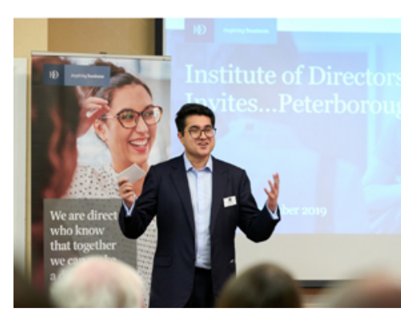
Policy team presenting at local member event

One thing is certain - the IoD will maintain an unwavering commitment to support its members, encourage entrepreneurial activity and promote good governance for its members and the business community as a whole.